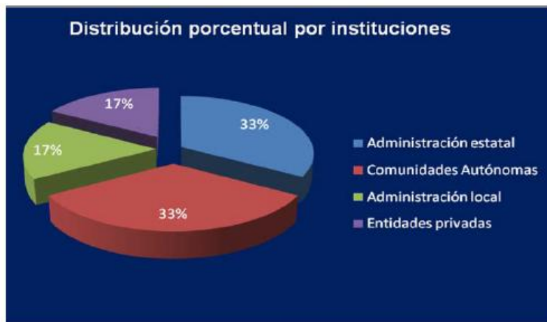
Percentage distribution by institution

State Authority Autonomous Regions Local Authority Private Entities