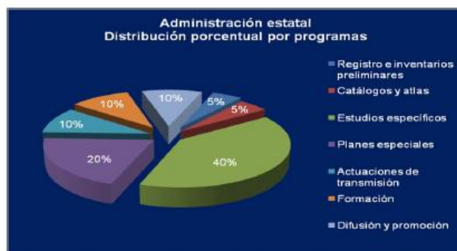
State authority Percentage distribution by programme

In accordance with this, the percentage invested in each of the lines of action set out by the Plan on the part of the various entities would be as follows: