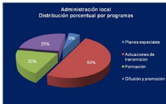
Local Authority Percentage distribution by programme

Preliminary inventories and register Catalogues and atlases Specific studies Special plans Transmission actions Training Dissemination and promotion