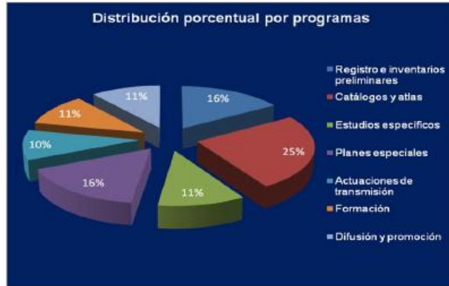
Percentage distribution by programme