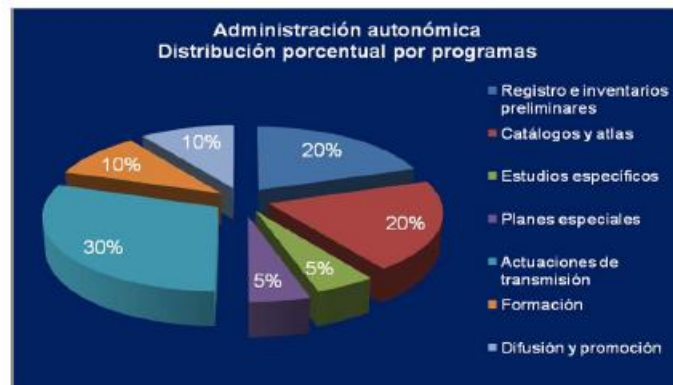
Regional authority Percentage distribution by programme

Preliminary inventories and register Catalogues and atlases Specific studies Special plans Transmission actions Training Dissemination and promotion